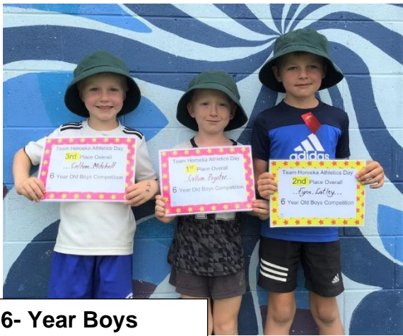
6- Year Boys