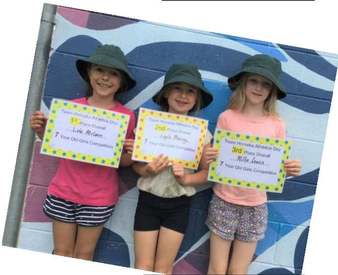
7- Year Girls