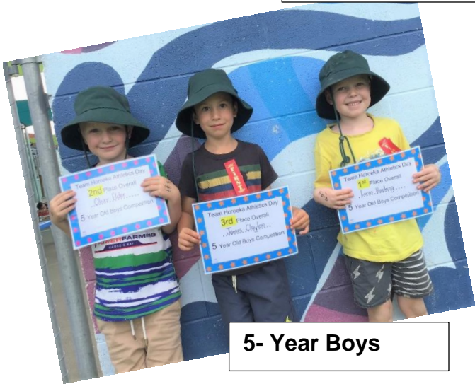
5- Year Boys