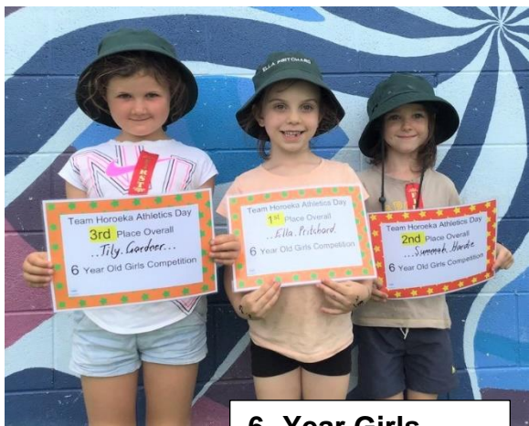
6- Year Girls