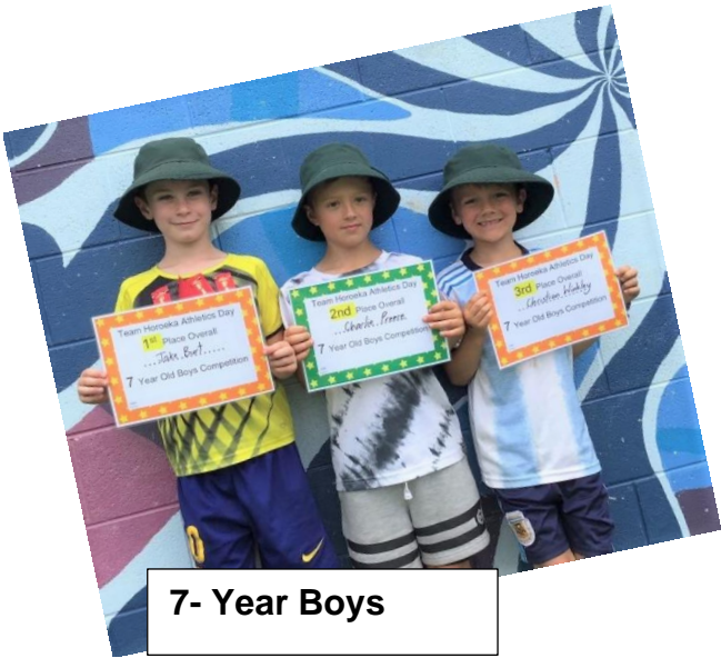
7- Year Boys