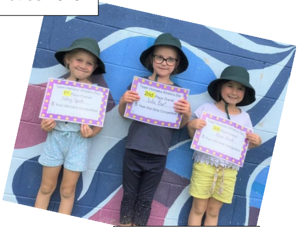
5- Year Girls