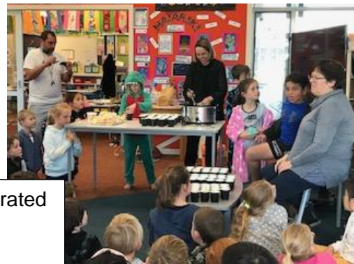
Team Kowhai celebrated Matariki. They each bought along one vegetable and combined them all to make yummy soup.