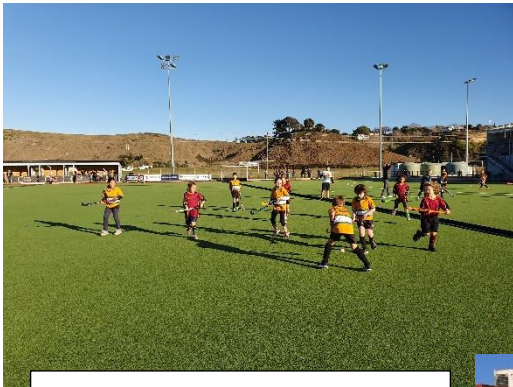
AMS Strikers in action on the turf on Saturday morning.